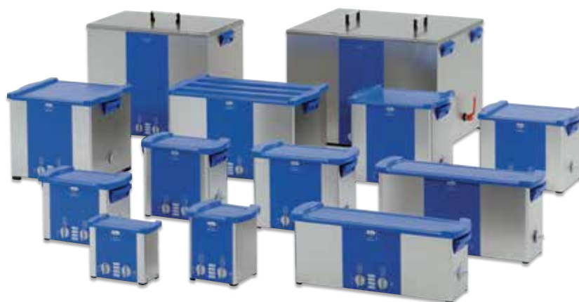
unit sizes from 0.8 to 90 litre

Elma has its own chemical laboratory to test and establish high-quality cleaning processes. The advantages: process, chemicals, units, cleaning technology and service – all from one source made by Elma.