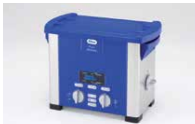
Elmasonic P table-top unit

From table-top unit to custom-made robot installation