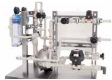
Safe, IR welded piping