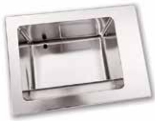
Tanks with rounded corners, electro-polished surfaces