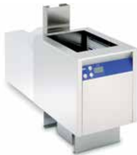
Optional: infrared or hot air dryer