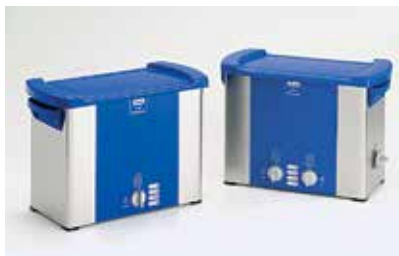
Elmasonic S 60 and S 60 H